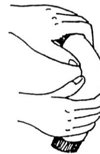
Bend to Activate-Hold Upright

Useable immediately. (Although it may take several hours for the smoke to flow at its maximum).