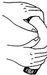
Bend to Activate-Hold Upright